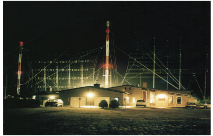
Figure 1. Take-Off Angle – Dipole Curtain Array with reflecting screen